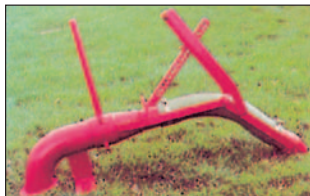
Jetter for above ground store

It incorporates many of the outstanding features of the 3000 model such as: unrivalled manoeuvrability; ease of operation; total operator safety as frame sits on top of slots covering open manhole at all times; slurry jetting height adjustable from the tractor seat.